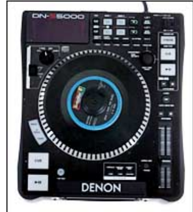
Denon DN-S5000 $900; jog wheel on the deck spins like a motorized vinyl platter.