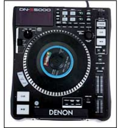
Denon DN-S5000 $900; jog wheel on the deck spins like a motorized vinyl platter.