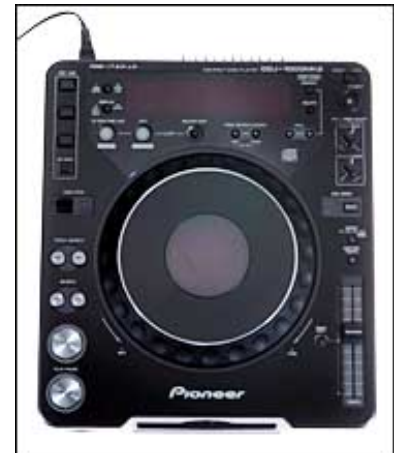
Pioneer CDJ-1000MK2 $1,300; pitch control slider and vinyl mode.