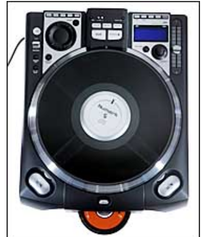
Numark CDX $800; can play MP3 files stored on CD-R/RW; loop-in function.